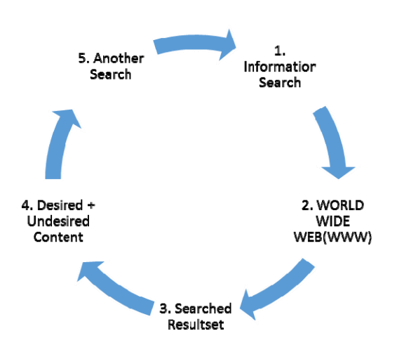
Fig. 1. Information Search Life Cycle

Top 10 such results are retrieved for the user entered keyword, if available. The proposed system can be studied in different various different perspectives such as follows: